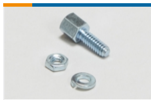
D-Sub Locking &amp; Mounting(29)